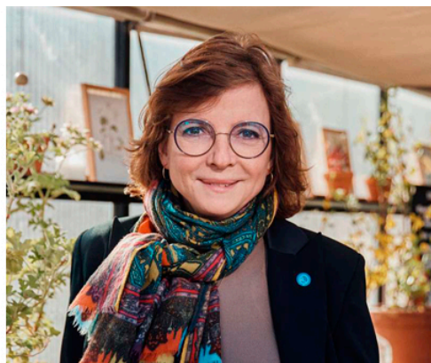
Jessica Rosencrantz, Minister for Nordic Co-operation and Karen Ellemann, Secretary General of the Nordic Council of Ministers

The vision of a Nordic Region which is the most sustainable and integrated region in the world by 2030 is what gives shape to the activities of the Nordic Council of Ministers. The Ministers for Nordic Co-operation (MR-SAM) have overarching responsibility for the co-ordination of work relating to this vision, and they also have a special responsibility to promote cross-sector co-operation, to raise Nordic affairs internally within their governments and to monitor the overall performance of the Council of Ministers.