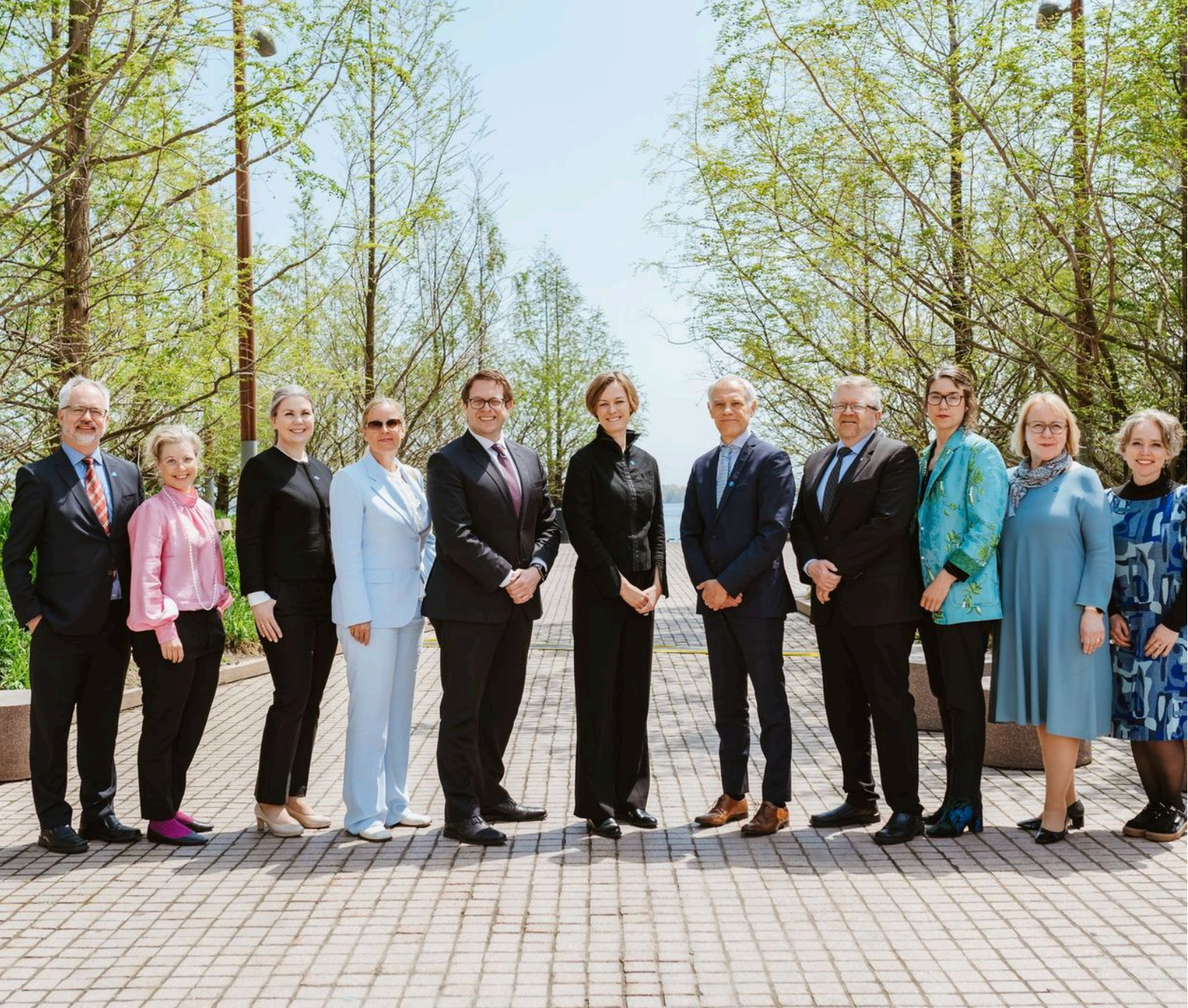
High-level meeting between the Nordic Council of Ministers for Culture and Canadian Heritage (Government of Canada).