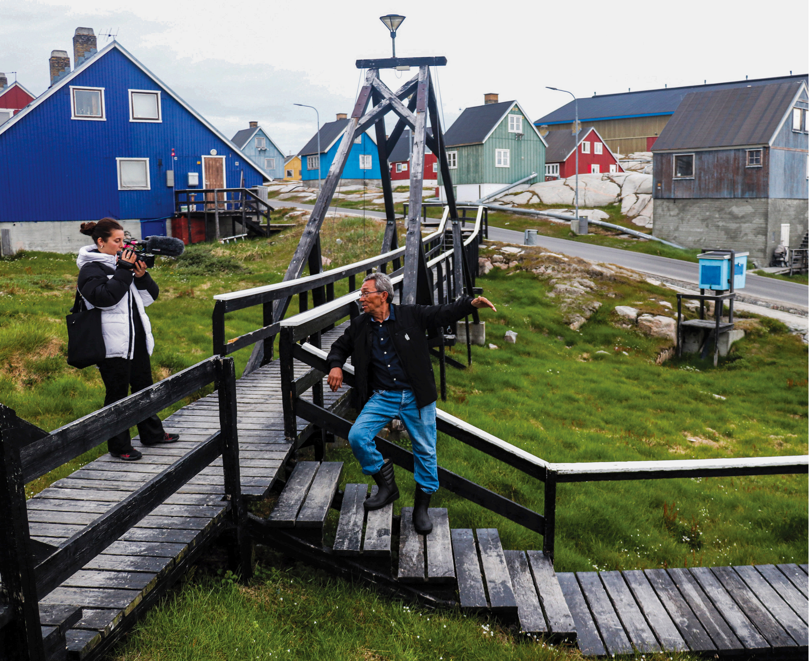
Reflections from Attu , photo from the Dispatches exhibition at Harbourfront Centre in Toronto.

from the Nordic-Canadian Fellows in Environmental Journalism