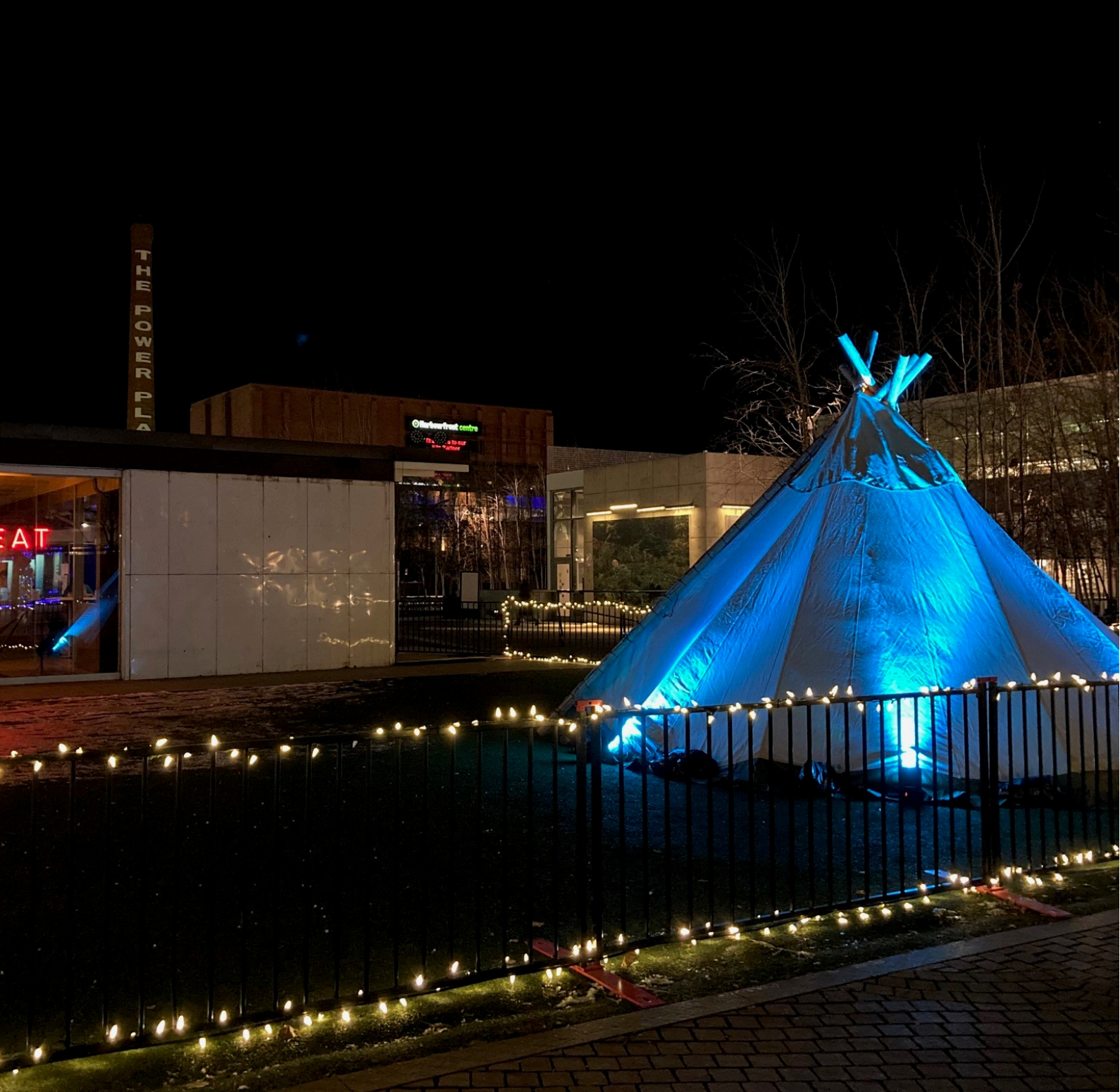
ART SPIN: Mobile Sweat. Catrine Pedersen and Stina Fagertun: Under the Northern Lights – Stories and more from Arctic Norway.